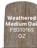
Weathered Medium Oak FB310165 OZ