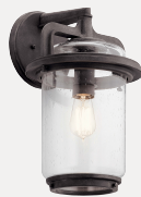
Outdoor Wall 49864WZC

To see the complete Andover Collection visit Kichler.com .