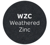
WZC Weathered Zinc