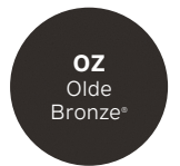
OZ Olde Bronze®