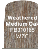
Weathered Medium Oak FB310165 WZC